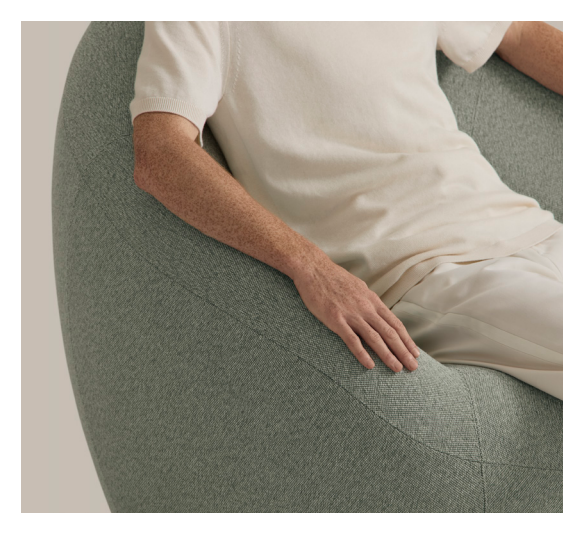
Shapes seem irregular but they're far from formless. Structured seats require extra artistry and skill to upholster around edgeless corners.