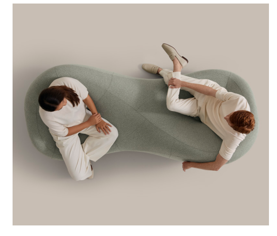
Ateliers Jean Nouvel reimagines the classic French tête-à-tête loveseat in a sculptural update that intuitively brings people together.

Echoing the spontaneity of natural formations in landscapes, water and sky, any grouping of furniture can be assembled to create organic clusters and currents — and never be the same twice.